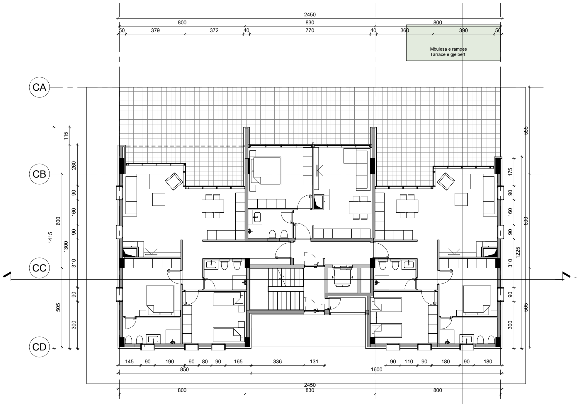
objekti C - plani i katit perdhe